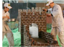
Chocolate Great Wall & Terracotta Warriors!