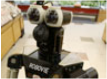
Shopping assisting robot