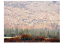
Beautiful Danxia landscape in NW China's Qinghai Province