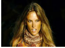
Sao Paulo Fashion Week