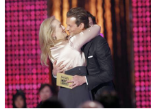
Celebs accept awards in 15th Critics' Choice Movie Awards in LA