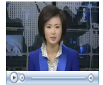
China News 2010.1.9