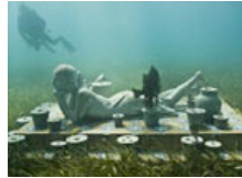
Wonder world at bottom of sea