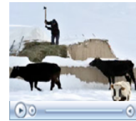
China News 2010.1.10