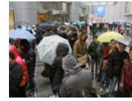
Shanghai citizens queue in rain for "Avatar"