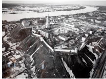
Photo by Medvedev auctioned for 1.7 mln USD